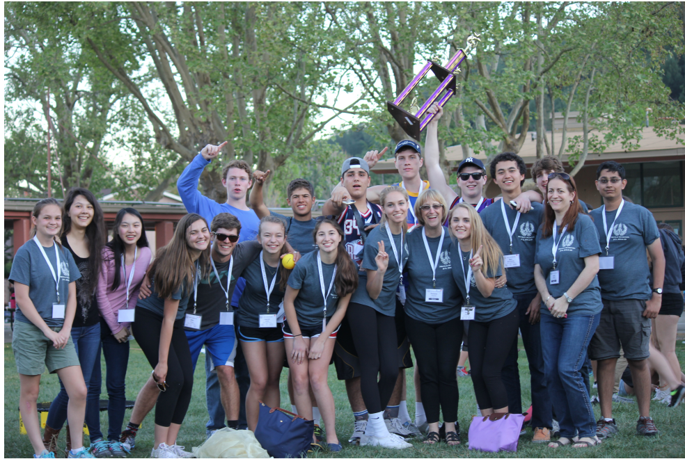
Menlo JCL smiles for a picture after winning first place overall at State Convention.