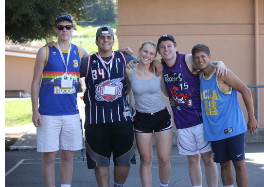
The basketball team smiles for a picture after winning.