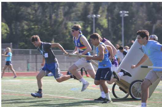
The boys chariot team competes at convention where they placed 3 rd .